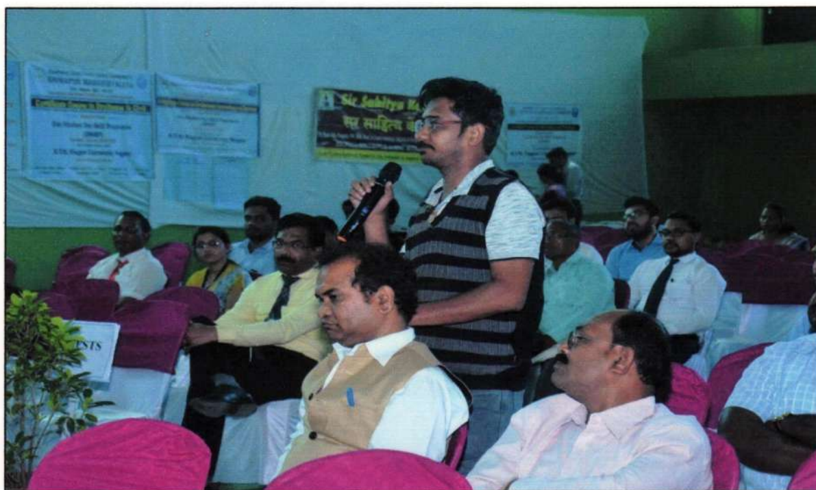
One of the presenters posing a query during the Question and Answer Session.