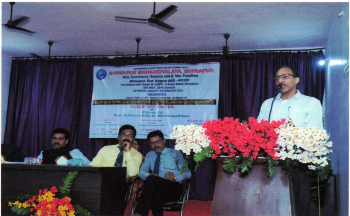
One of the participants giving feedback during the Two- Day National Seminar.