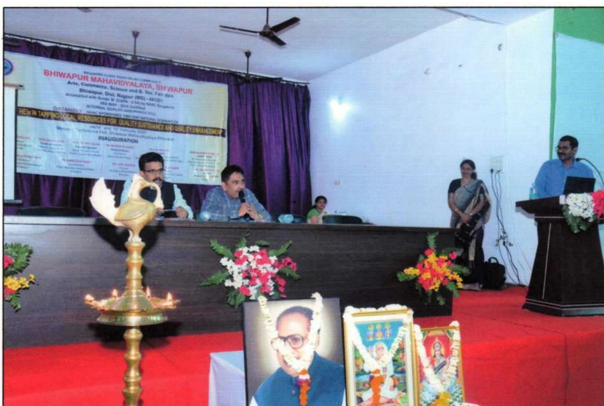
One of the Paper Presenters keenly listening to the expert comments on the Research Paper presented.