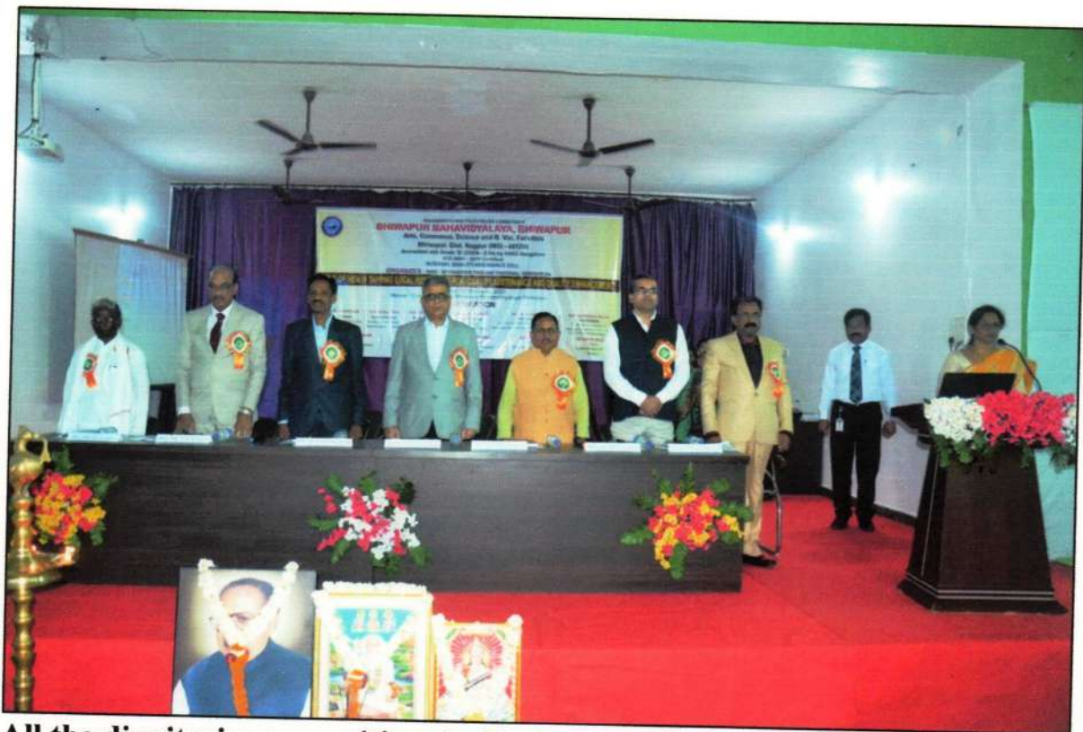
All the dignitaries are reciting the National Anthem after the Inaugural Function.