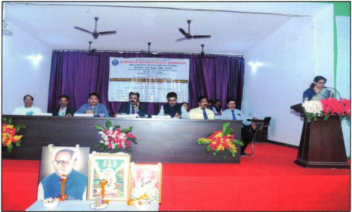
All the distinguished dignitaries on the dias during the Valedictory Function of the Two- Day National Seminar.