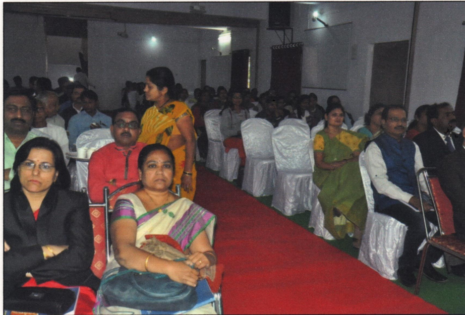
Delegates attending the National Seminar

About 153 delegates from across the Country along with esteemed citizens of Bhiwapur were present on this occasion