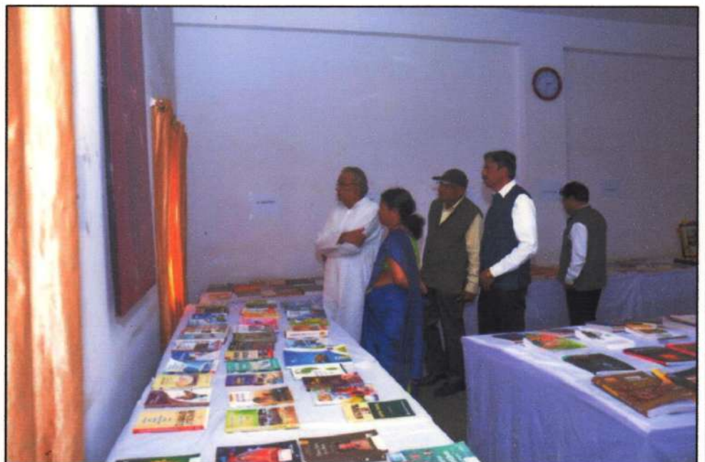
Dignitaries along with the teaching staff of the College enjoying the 'Book Exhibition'