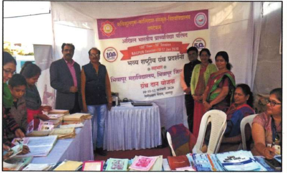
Stall set by 'Library and Information Centre' of Bhiwarpur Mahavidyalaya in "Granth Daan Programme' organized under the auspices of Akhil Bharatiya Prachya Vidya Parishad, Kavi Kulguru Kalidas Sanskrit University, Ramtek