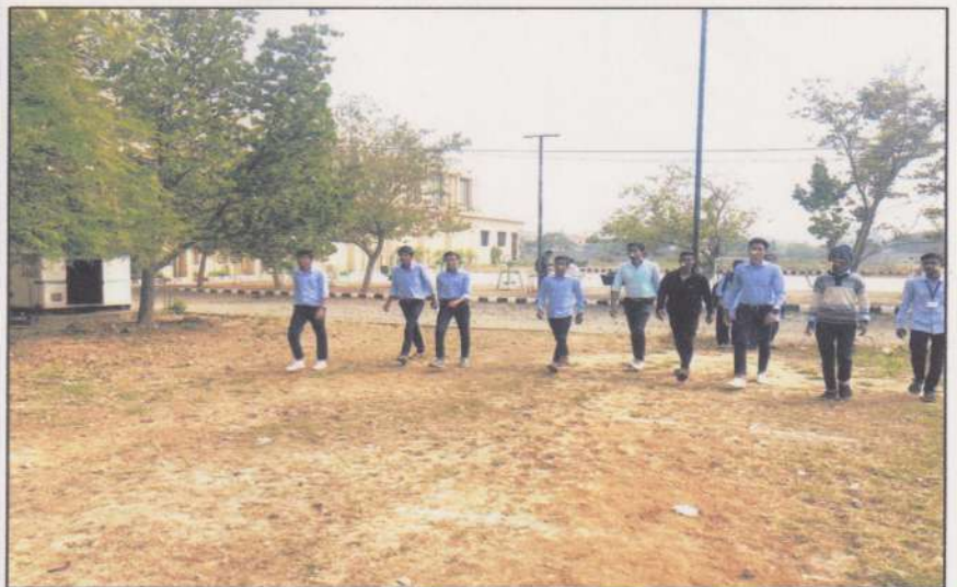
Boys, in action, during the Lemon Spoon Race