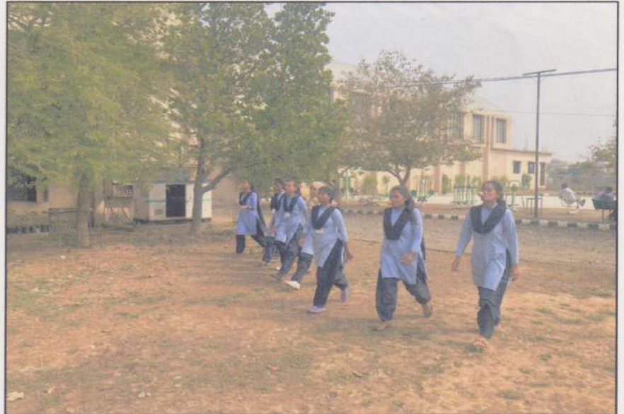
Girls, in action, during the Lemon Spoon Race