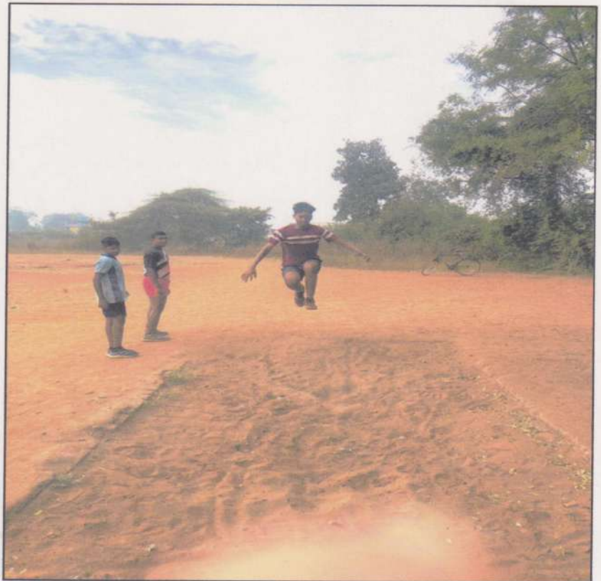
Boys, in action, during the Long Jump Event