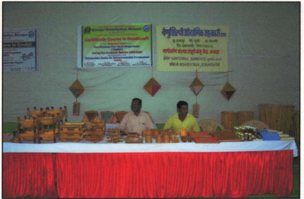
Exhibition of Bamboo Handicraft articles during the Inaugural Ceremony of 'Handicraft Training Programme'.