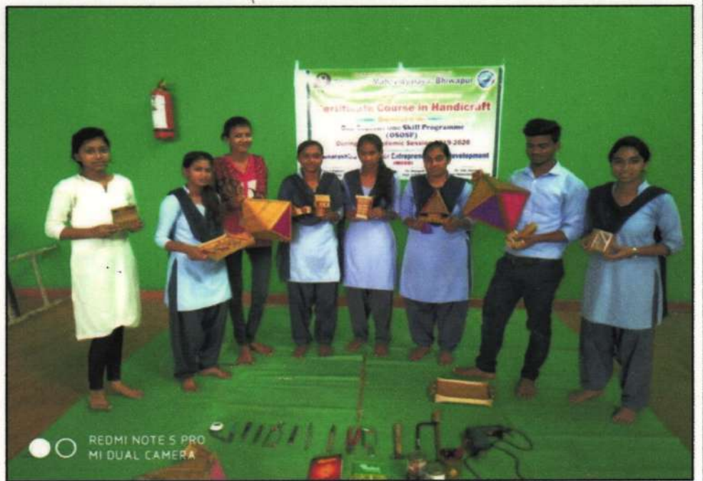
Our Students showing various articles made from Bamboo after successful completion of the Training Programme on 'Bamboo Handicraft'.