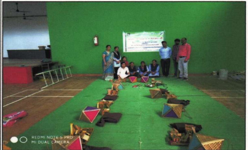
Students displaying Bamboo Handicrafts Articles made by them during the Training Programme 'Bamboo Handicraft'.