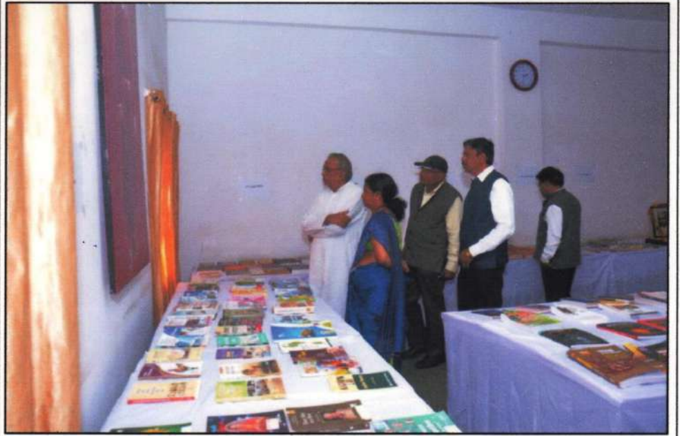
Dignitaries, along with the teaching staff, watching the 'Book Exhibition'