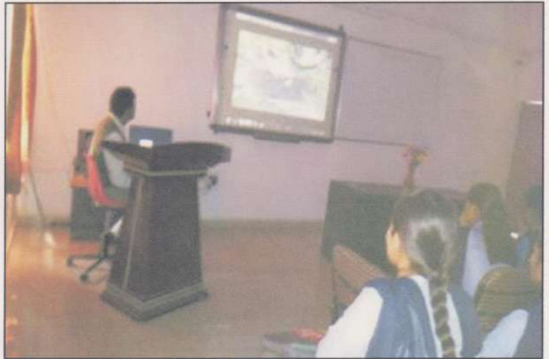
Students watching Documentary on “Maza Kay Gunha”