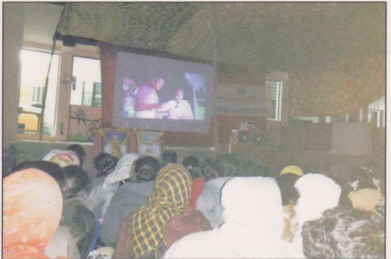
Rural Women watching the Documentary on “Maza Kay Gunha”