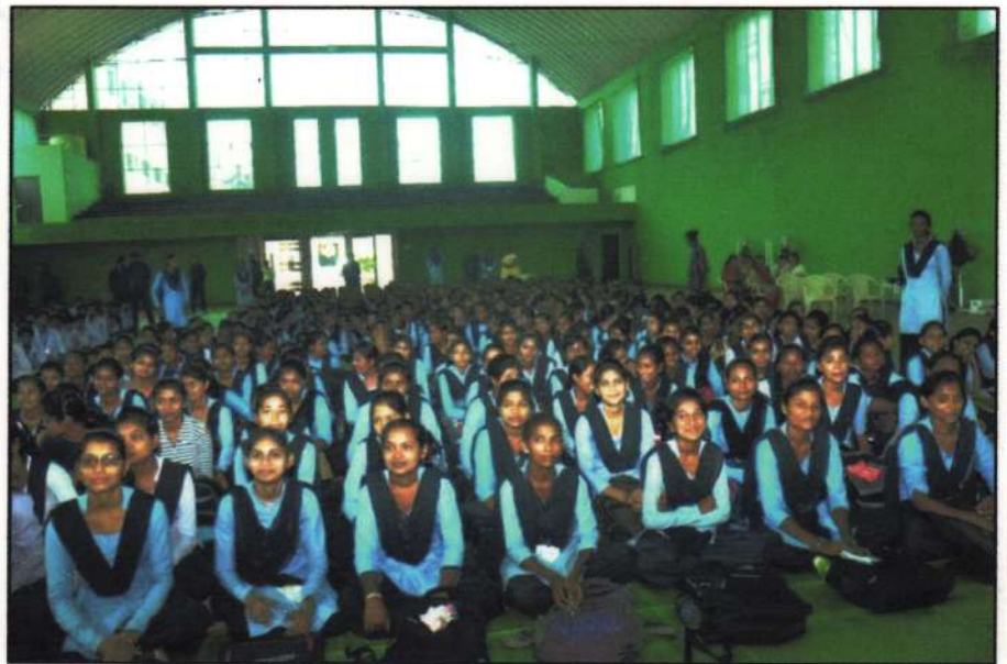
Students and staff of the College attending the Library Orientation Programme