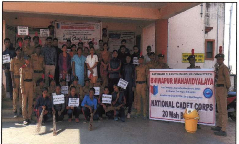
NCC Cadets posing after cleaning the Government Rural Hospital premises