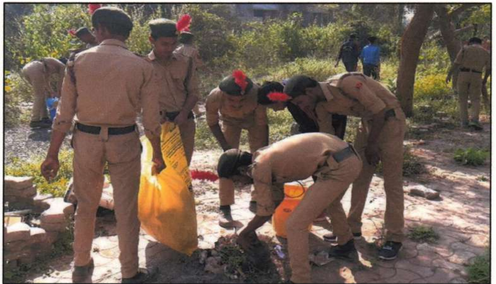
NCC Cadets cleaning the premises of Government Rural Hospital, Bhiwapur