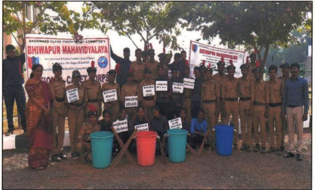
NCC Cadets posing after cleaning the College premises