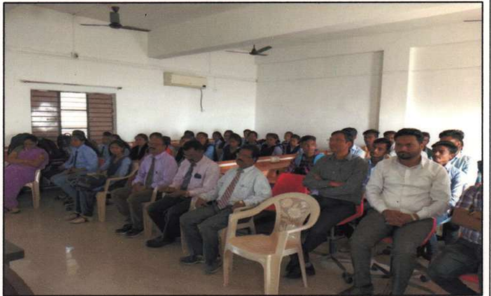
The students and staff of our Institution attending the programme