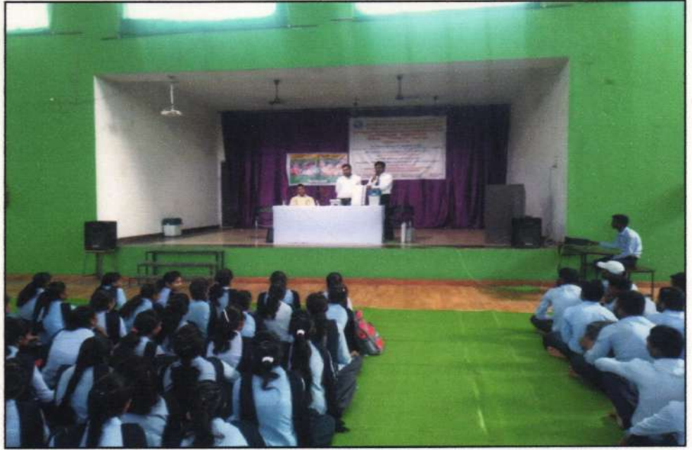
Programme at a glance