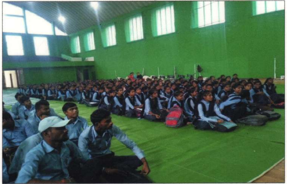
Students look on during the demonstration of Voter Verifiable Paper Audit Trail (VVPAT)