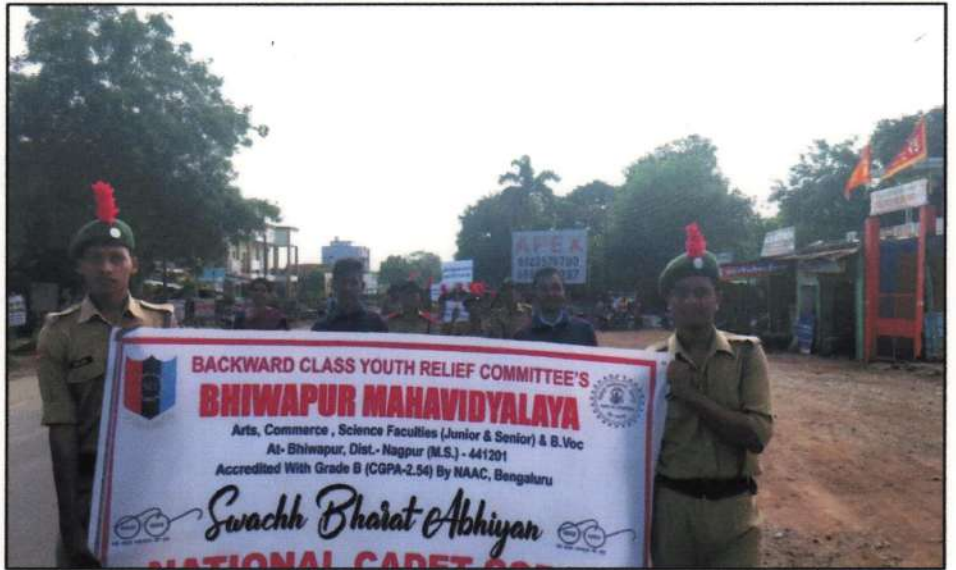
The NCC Cadets participating in the Rally