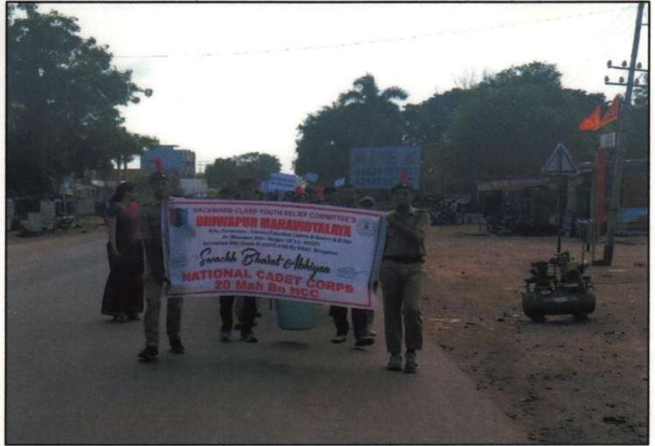
The NCC Cadets participating in the Rally