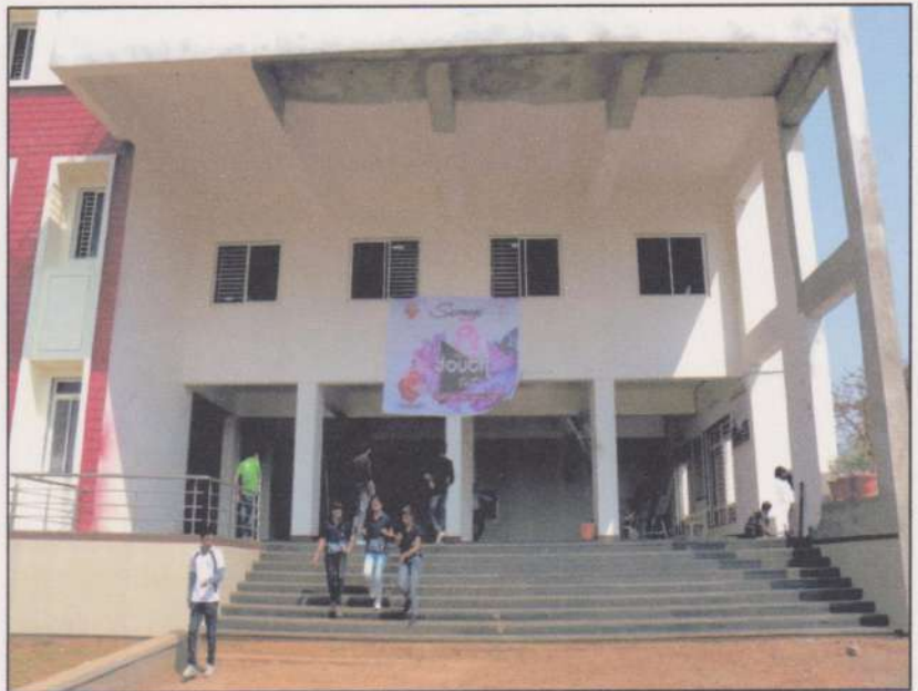
Brochure of the SAMEP-2018 Youth Fest