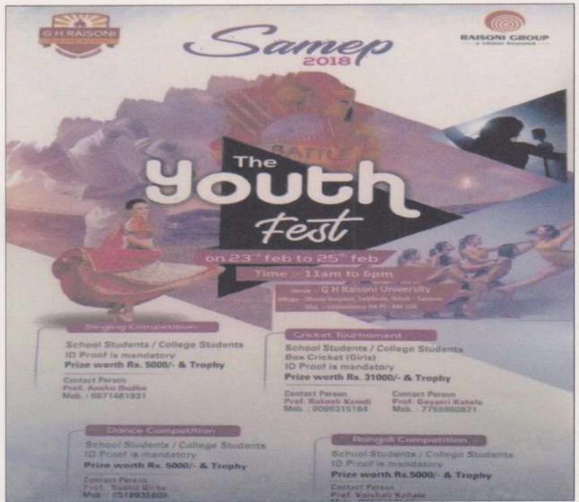
Invitation of the SAMEP-2018 Youth Fest