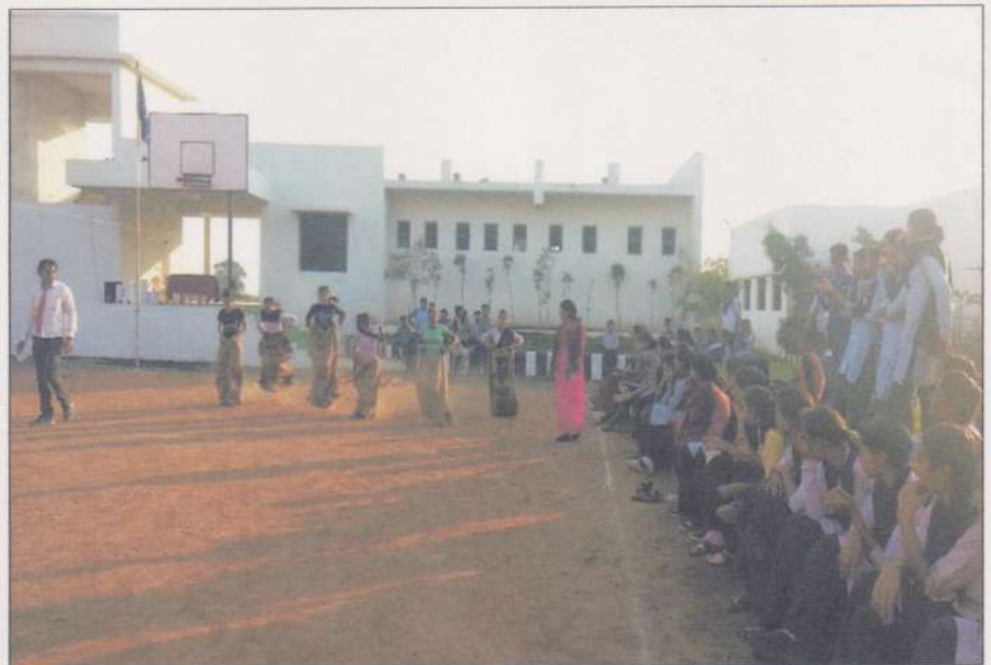
Girls, in action, during the Sack Race Competition