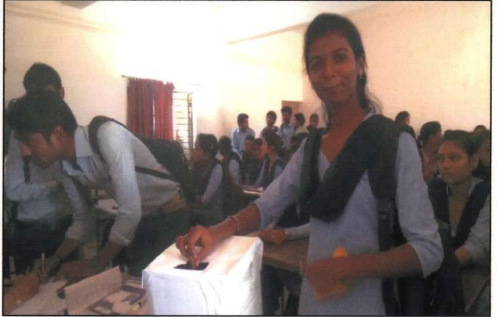
Students casting their vote during the Election process of Internal Complaint Committee to elect students' representatives on 25-02-2017