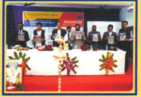
U.G.C. Sponsored One Day National Seminar 'Human Rights of the Subjugated'