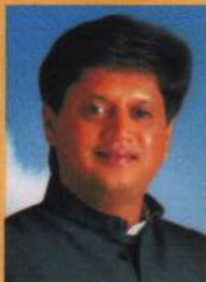
Hon'ble Shri Rajendra B. Mulak Ex. Minister of State (Govt. of Maharashtra) Finance & Planning, Energy, Water Resources, Parliamentary, Affairs & Excise Hon. Secretary, BCYRC and BMCT