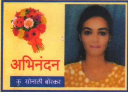
अखिल भारतीय आंतरविद्यापीठ व्हॉलीबॉल स्पर्धेतील उपविजयी. रा.तु.म. नागपूर विद्यापीठ व्हॉलीबॉल संघात समावेश