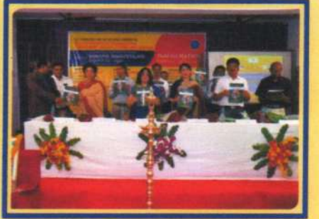
Unveiling of the Conference Proceedings during National Seminar on "English Studies in a Transnational Environment : Society, Culture and Language".