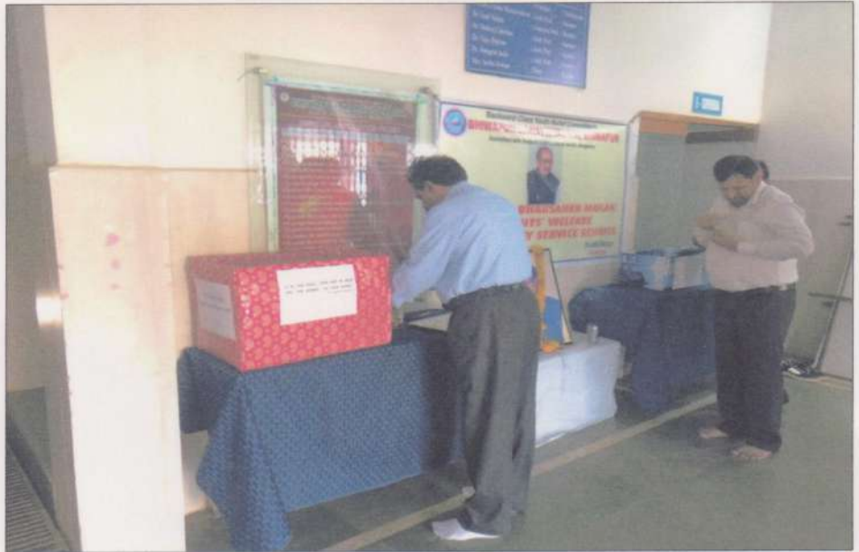
Students donating in the Alms Box for this noble cause