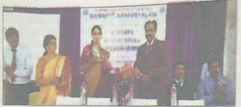
A guest being welcomed at the event.