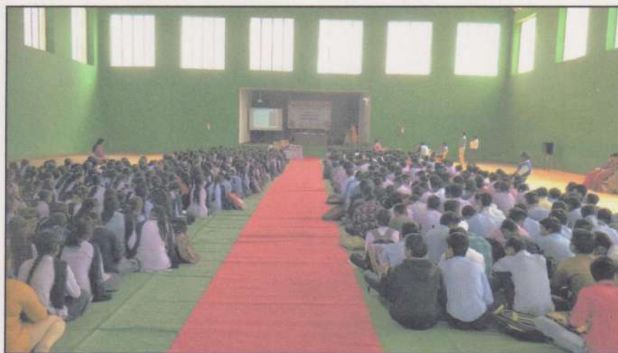
Students and staff attending the Library Orientation Programme