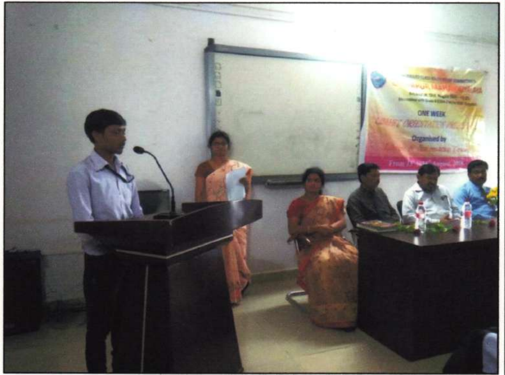
Students participating in the Book Review Competition