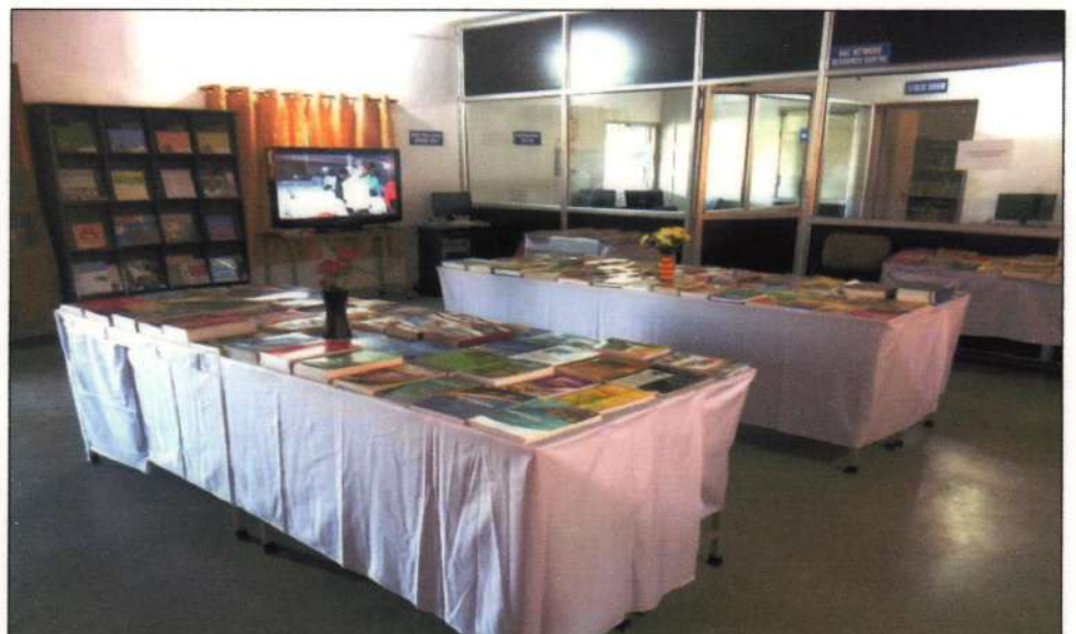
Glimpses of the 'Book Exhibition'