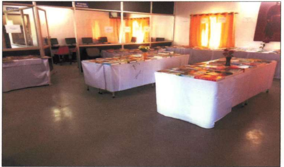
Glimpses of the 'Book Exhibition'