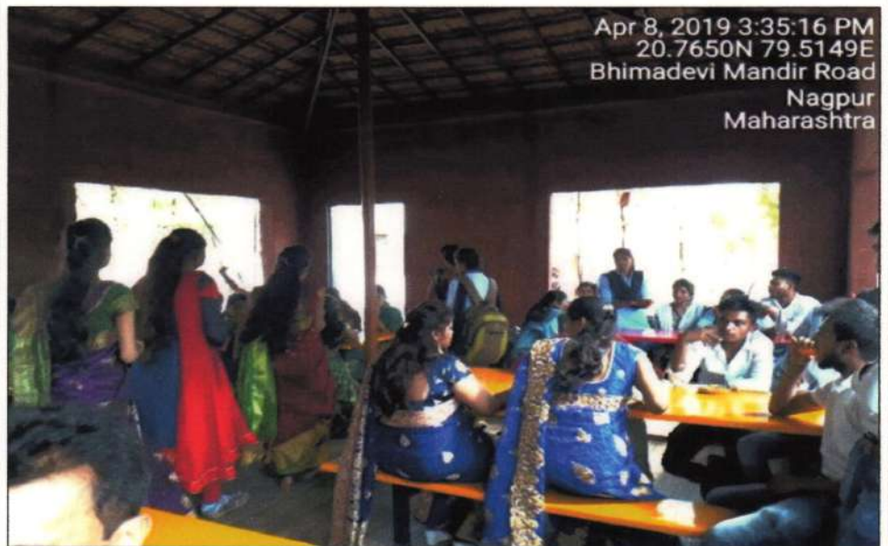
Final Year Students while enjoying Feasts in the College Canteen.