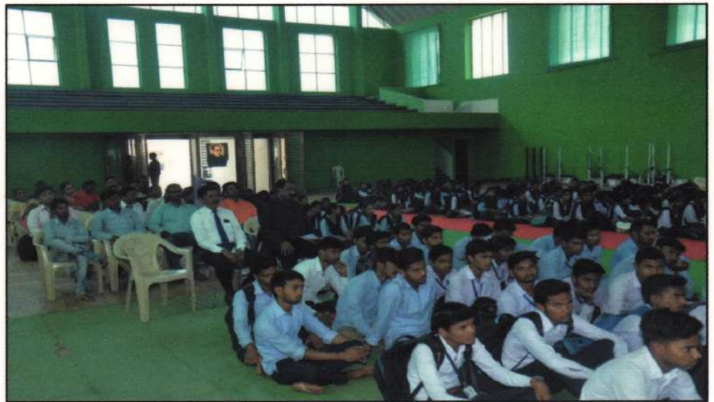
Students and staff members along with college alumni and locals