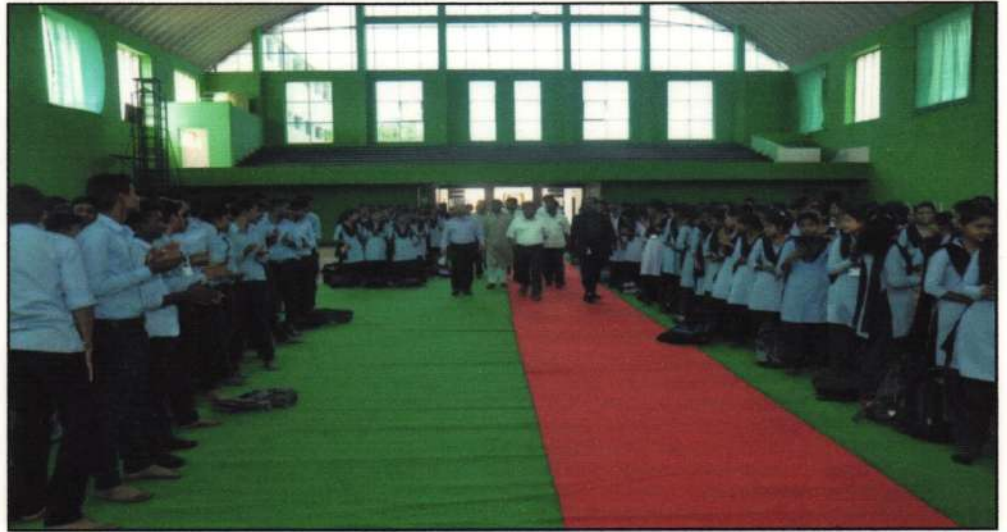
Students welcoming the guests