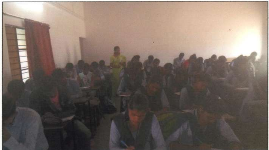
Students participating in the 'Challenging Questions Contest'.