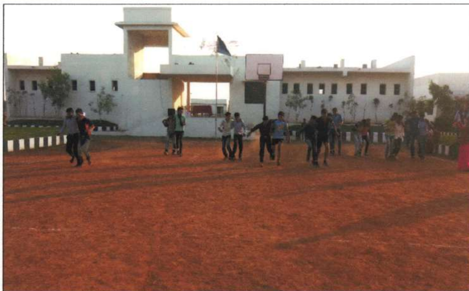
Students participating in '3-Leg Race Competition (Boys)'