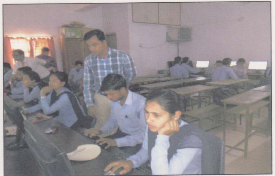
Students attending the Practical Session of the Self-financing Certificate Course in 'Financial Accounting' using Tally ERP – 9.