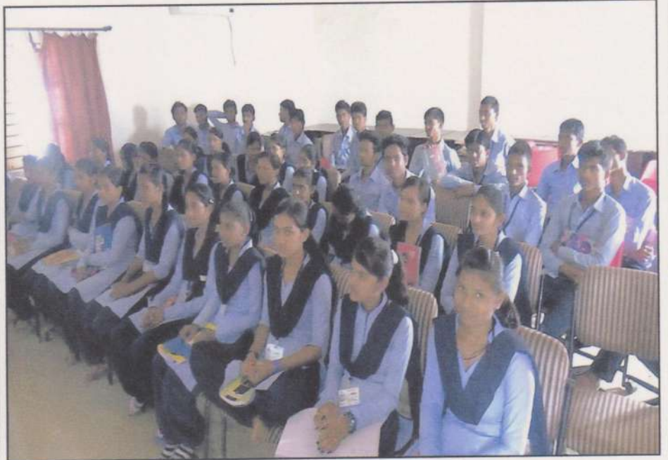
Students of our Institution attending the Theory Class Session of the Self-financing Certificate Course in 'Financial Accounting' using Tally ERP – 9.