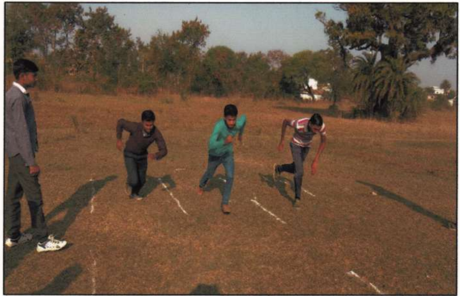
Boys, in action, at the beginning of 100 Meter Race