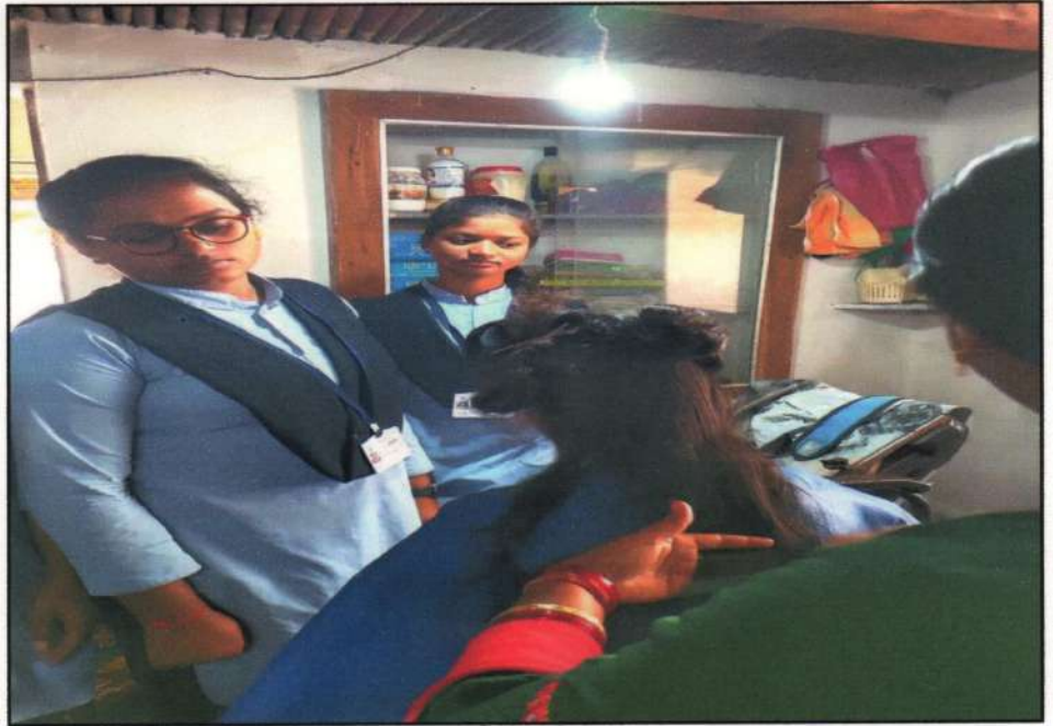
Girl-trainees undergoing the Training Session of Hair Cutting during the Practical Session of the Self-Financing Certificate Course in 'Beautician'.