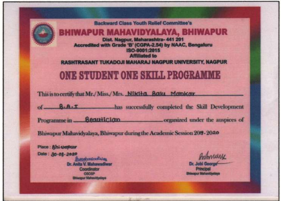
Specimen of the Certificate issued to the successful Trainees upon completion of the Self-Financing Certificate Course in 'Beautician'.