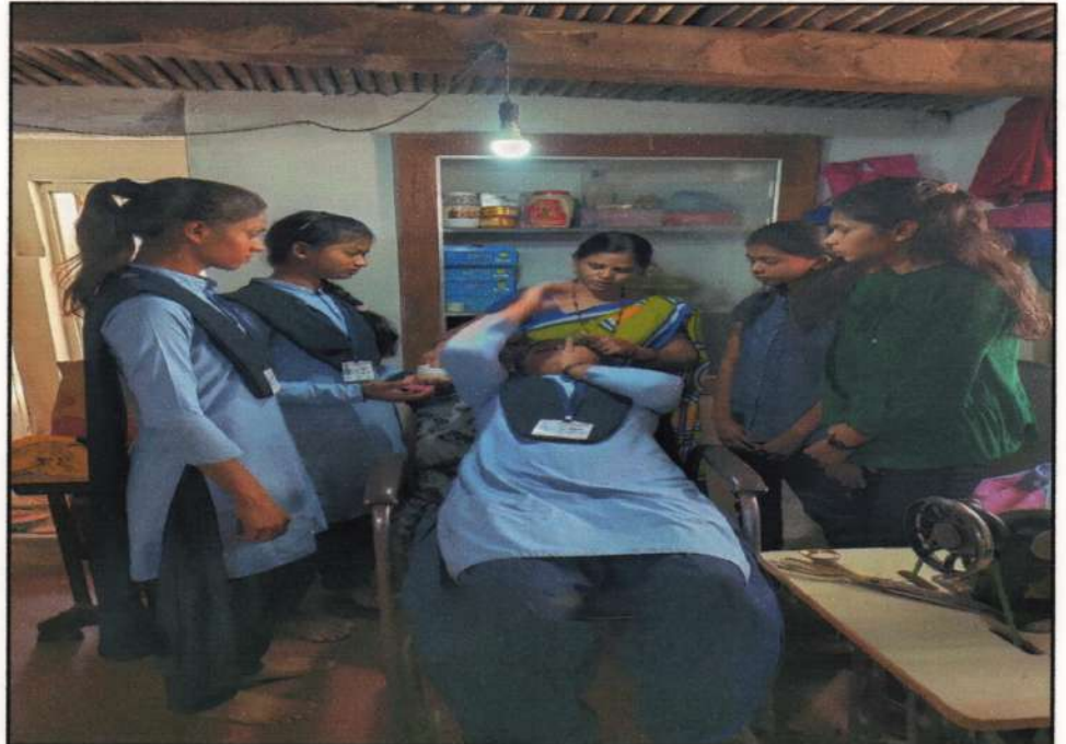
Girl-trainees undergoing the Training Session of Eyebrow Threading during the Practical Session of the Self-Financing Certificate Course in 'Beautician'.