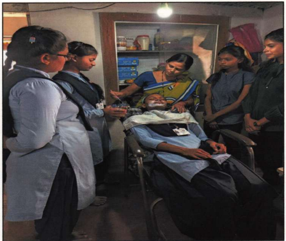
Girl-trainees undergoing the Training Session of Facial Massage during the Practical Session of the Self-Financing Certificate Course in 'Beautician'.