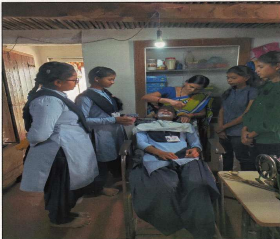
Girl-trainees undergoing the Training Session of Facial Massage during the Practical Session of the Self-Financing Certificate Course in 'Beautician'.