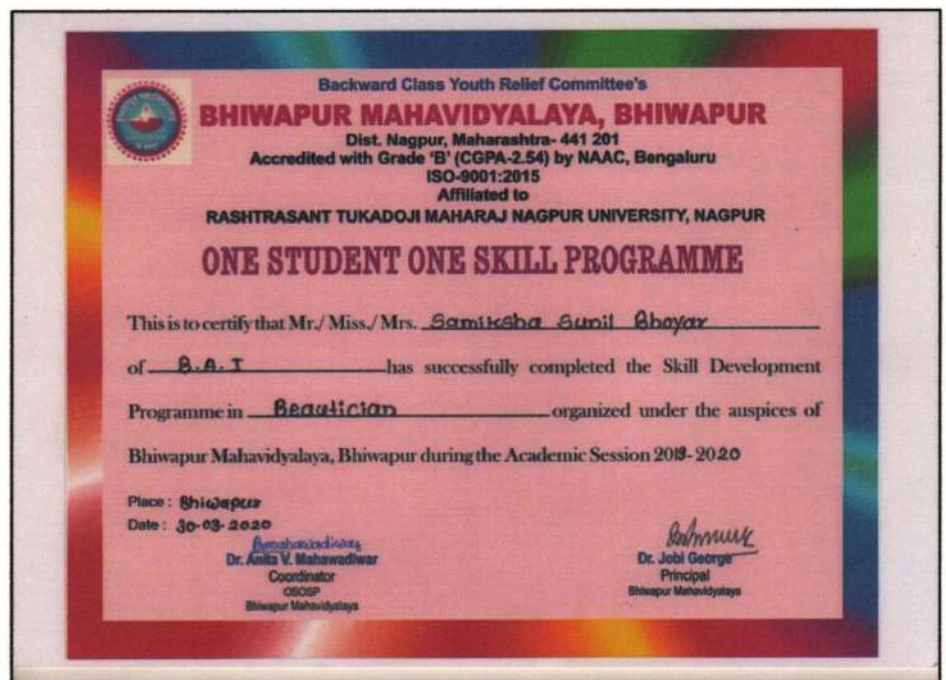
Specimen of the Certificate issued to the successful Trainees upon completion of the Self-Financing Certificate Course in 'Beautician'.