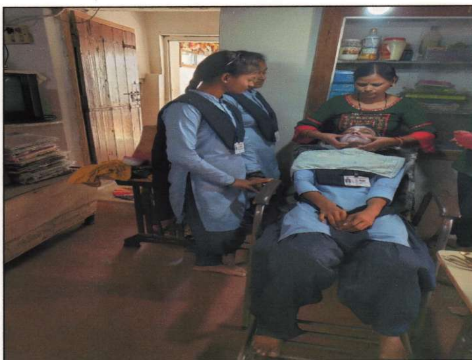
Girl-trainees undergoing the Training Session of Facial Massage during the Practical Session of the Self-Financing Certificate Course in 'Beautician'.