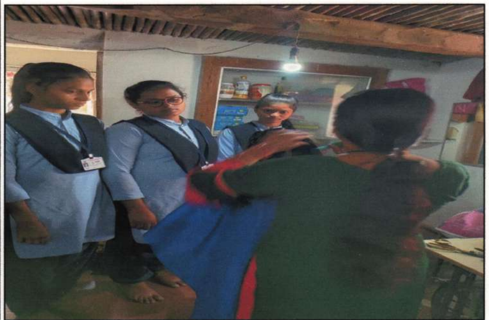
Girl-trainees undergoing the Training Session of Hair Cutting during the Practical Session of Certificate Course in 'Beautician'.