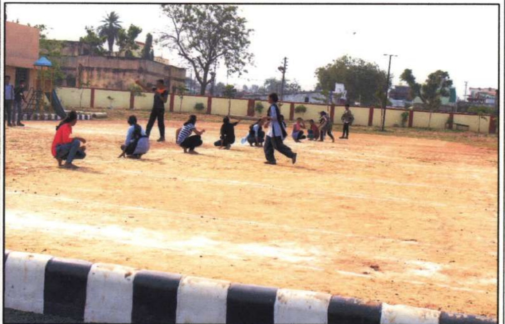
Girls in action during the 'Kho-Kho Championship'