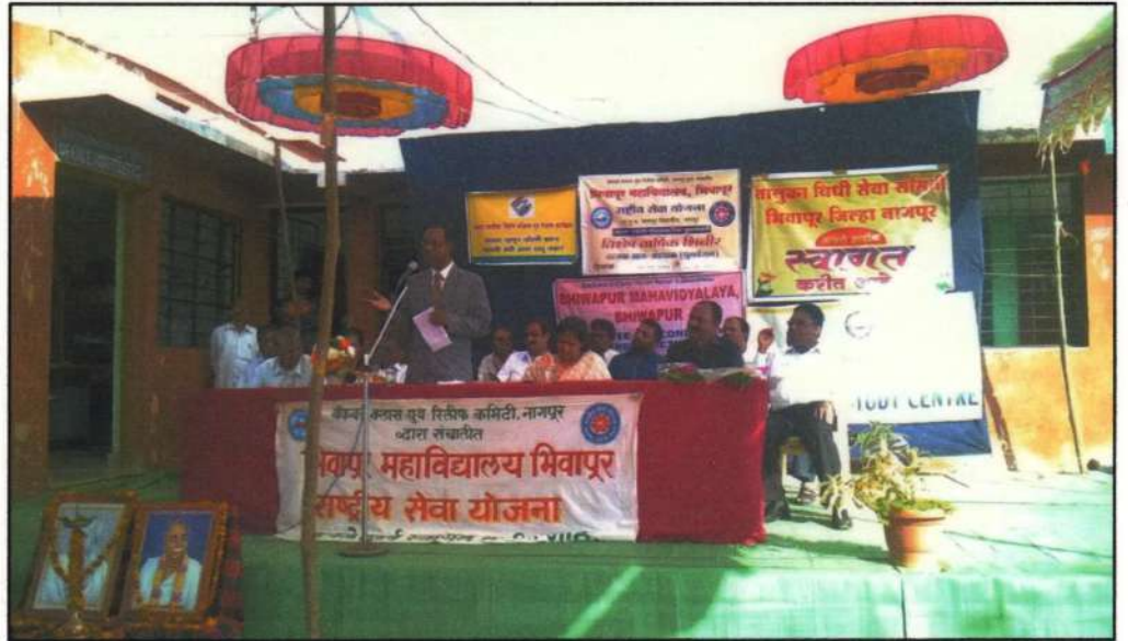
Hon. S.A. Khalane, Sitting Civil Judge of Bhiwapur, delivering his Presidential Address during the programme organized on the occasion of “National Voter’s Day”