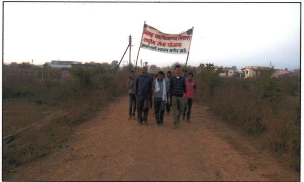
Volunteers, along with teachers, in "Jagaran Dindi" (Awareness March) during the Special Annual Camp of N. S.S