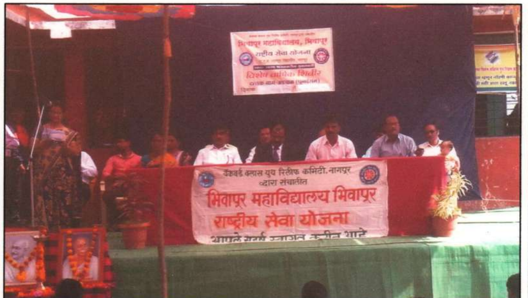
Dignitaries at Inaugural Ceremony of Special Annual Camp of N.S.S