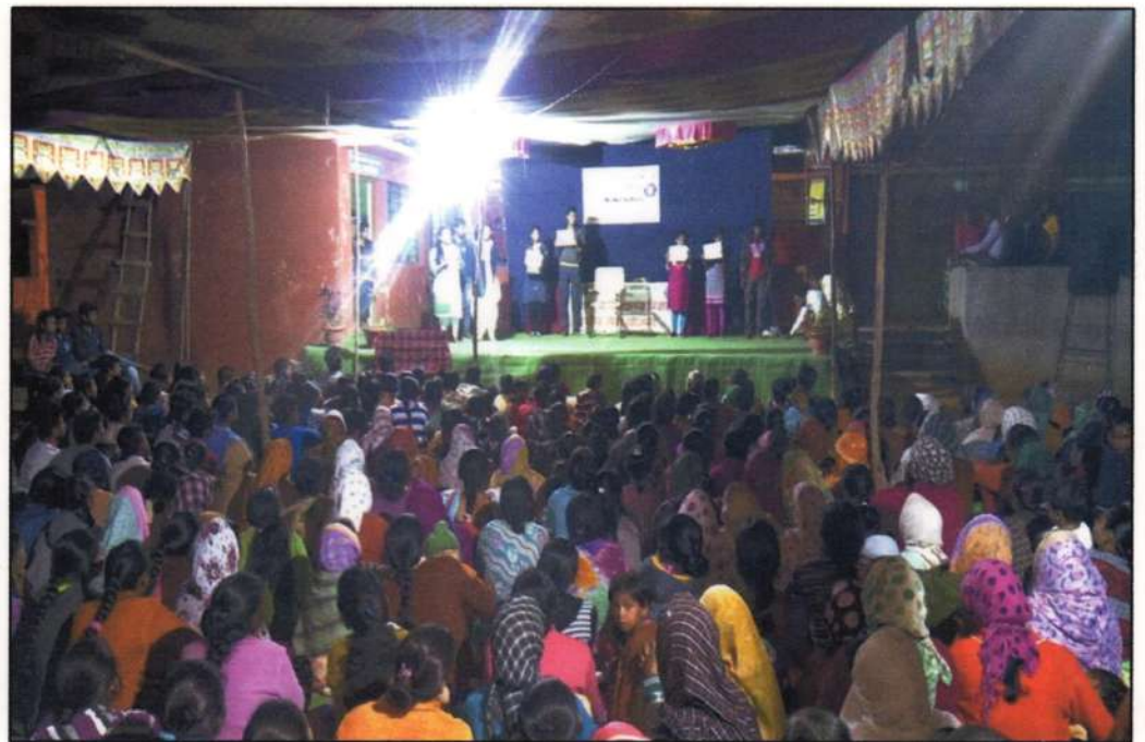
Volunteers of N.S.S. performing Cultural Activities for the entertainment of Villagers.