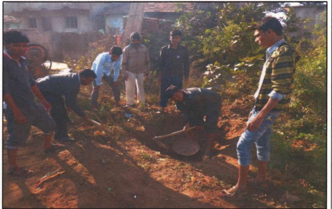
Volunteers of N.S.S. busy in Cleanliness Drive