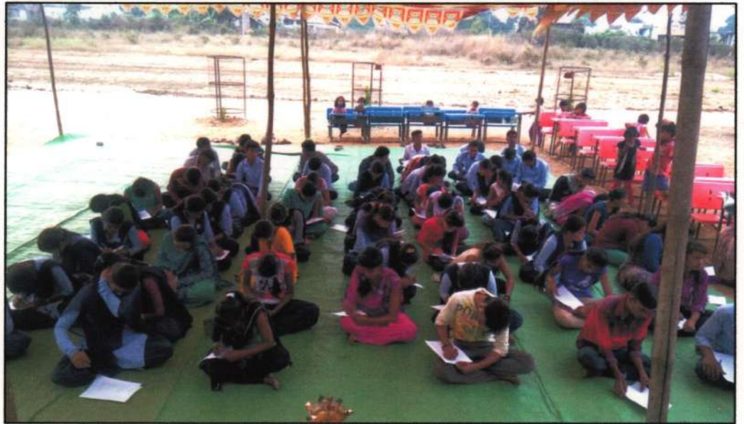
Volunteers of N.S.S. appearing in Written Examination based on General Awareness