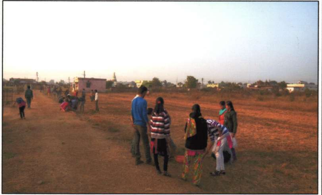
Volunteers of N.S.S. busy in the cleanliness drive conducted in the premises of Zilla Parishad School, Adyal.