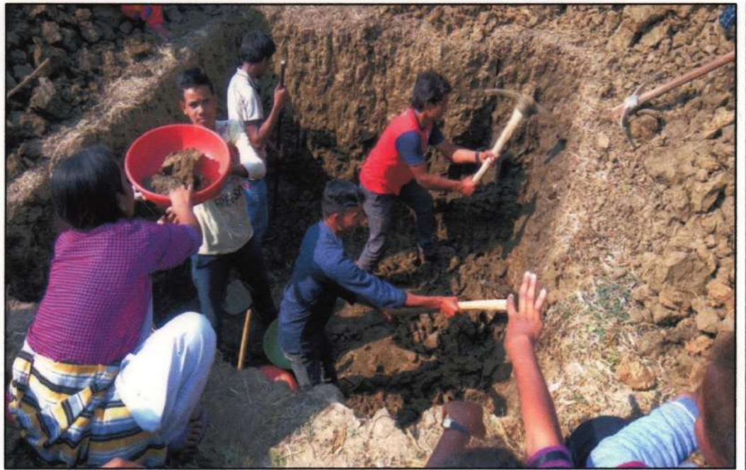
Volunteers of N.S.S. busy in digging pit for lavatory