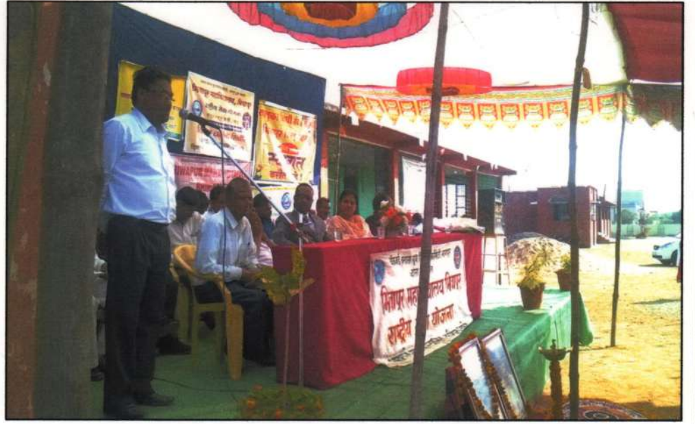
Adv. Rathod, Government Prosecutor, Bhiwapur Court, spreading awareness about 'Cyber Crime'