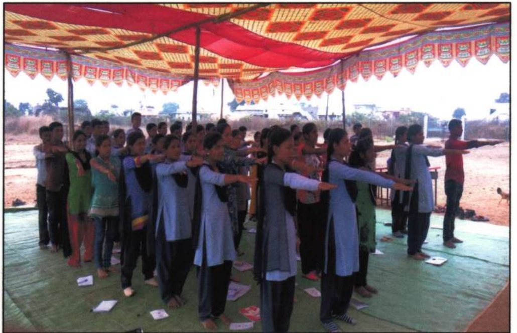
Volunteers administering Oath to create awareness regarding casting of Vote for strengthening the Democracy