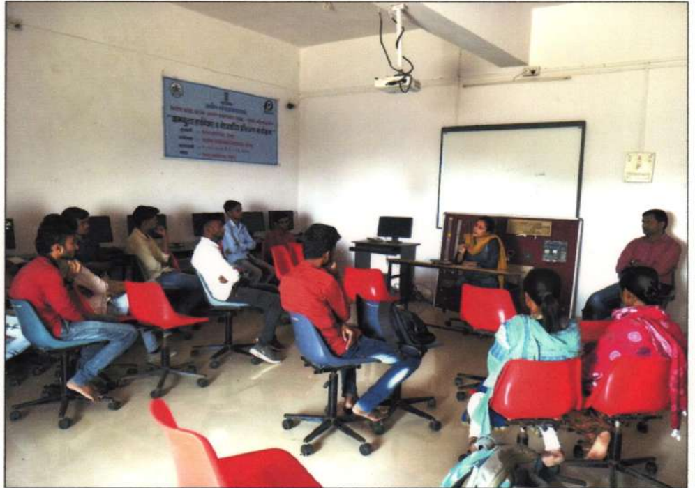
Students/ Youth listening in rapt attention during a lecture