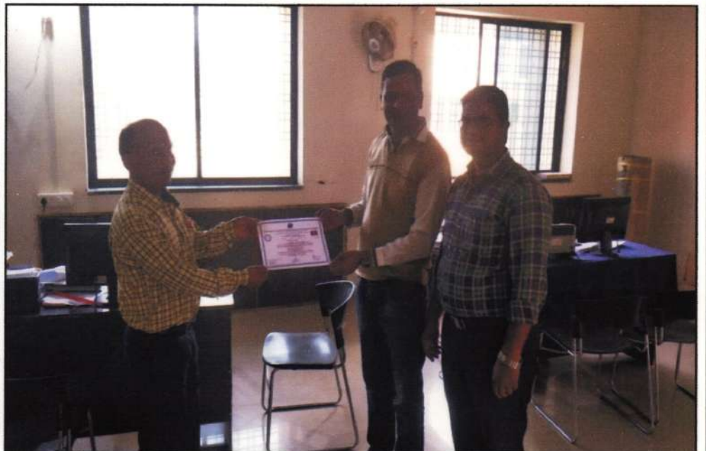
Students/ Youth receiving certificates on completion of the 40 days course