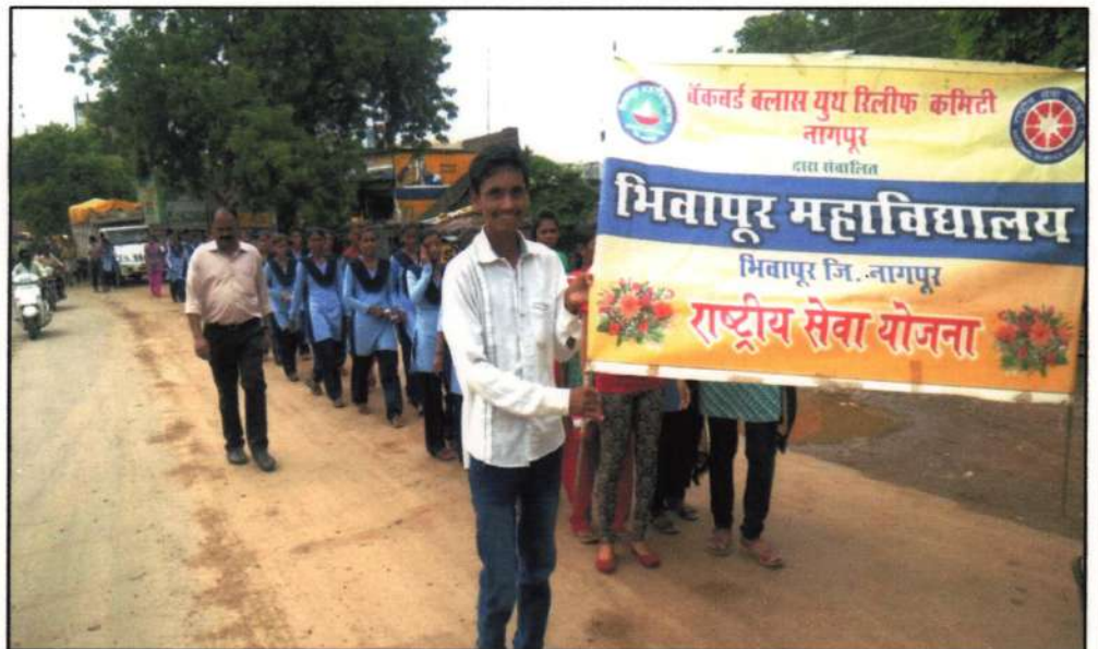
“Peace Rally” on the occasion of Birth Annevrsary of Mahatma Gandhi