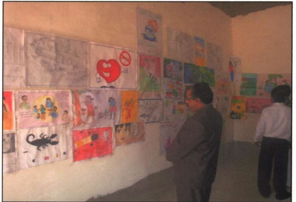
Display of posters in Poster Making Competition on various burning issues