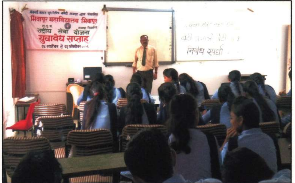
Organization of Essay Writing Competition on the theme “Beti Bachao- Beti Padhav’