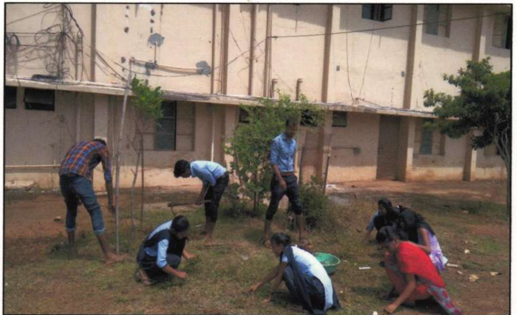
Volunteers of N.S.S were busy in the Cleanliness Drive conducted in the College premises on 2 nd Oct. 2016 under “Swachchh Bharat Abhiyan”