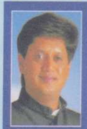
Hon'ble Shri Rajendra B. Mulak Ex. Minister of State (Govt. of Maharashtra) Finance & Planning, Energy, Water Resources, Parliamentary, Affairs & Excise Hon. Secretary, BCYRC and BMCT